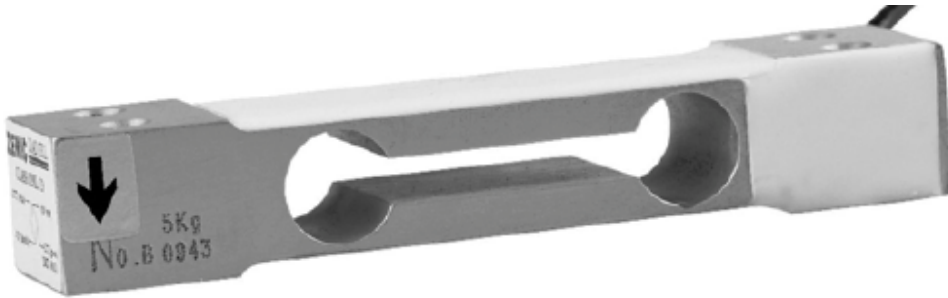
Model L6D / L6D-R1